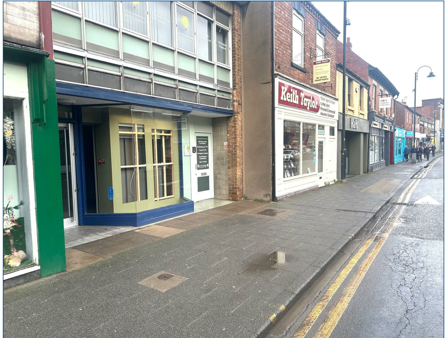
58, Gowthorpe, YO8 4ET